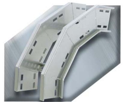
90° Outside Riser