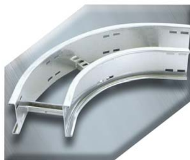
90° Flat Bend