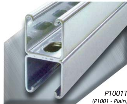
P1001T (P1001 - Plain)