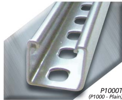
P1000T (P1000 - Plain)