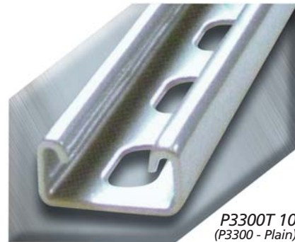
P3300T 10 (P3300 - Plain)