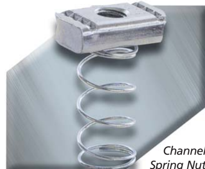
Channel Spring Nut