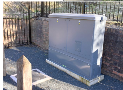
▲ Bedlam Furnaces, Telford