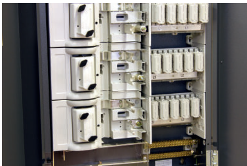
2 J MSDB Shrouds and fuse handles removed from one J way to show cable connection points