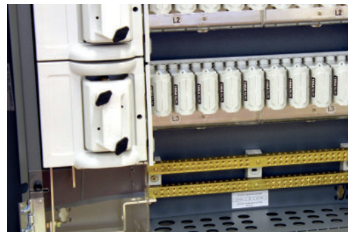
1 J MSDB 30 way MSDB showing gland plate detail