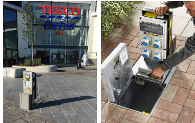
▲ Hampton, Peterborough

A range of standard sized units are held in stock for fast despatch, whilst special designs such as integrated data, utilities and metering kits are available on request.