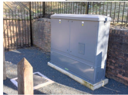
▲ Bedlam Furnaces, Telford